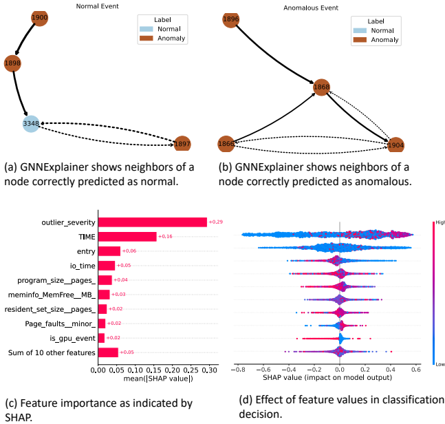
Fig. 4: Explainability of classifications made by the GraphSAGE classifier, (a) and (b), and the XGBoost classifier, (c) and (d), with the singlereuse dataset.

to other anomalous nodes, the normal node has weak connections to anomalous nodes. Further investigation shows that the feature values of the normal and anomalous events are the same, only the function runtime of the anomalous event is significantly larger than that of a normal sample. This observation validates that the model is able to correctly classify a node as anomalous because it does not conform to an expected behavior.